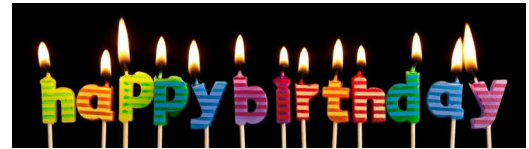
March 16 - Gus Glascock

Abram’s faith is sealed with a covenant initiated by God, our light and our salvation. The transformation of Jesus prefigures the transformation in glory to which we are called by our sharing in the paschal mystery - the dying and rising of Jesus.